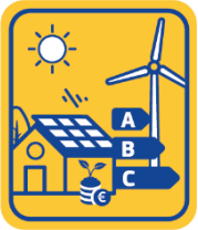
Clean Energy Transition