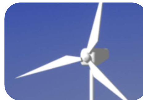
3. Electric Energy Matchmaking Forum for Ukraine Support