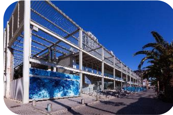
New headquarters 2001