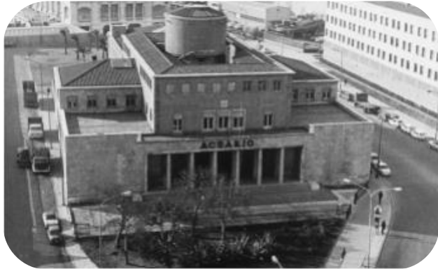
Opening Instituto de Investigaciones Pesqueras 1951